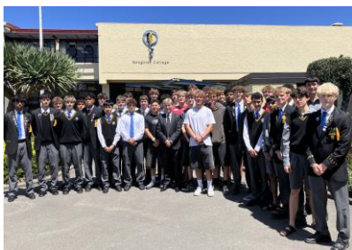
Academic Honour recipients