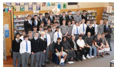
Academic Honour recipients at our school's academic lunch

We are now well into what is already proving to be a busy and exciting Term One. The boys are settled and working well in class; several visitors to the school have commented on the very calm atmosphere around the school.