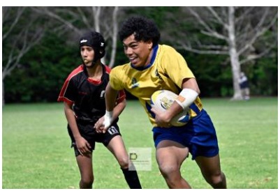
Under 15s in action

The U85kg Rugby team had a solid week in the U85 Nationals, with wins against St Pats Town, Wellington College, Newlands, and Onslow. They finished the week in 4<sup>th</sup> place after a close loss to Kings College in the 3/4<sup>th</sup> playoff.