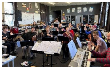
The orchestra rehearsing for Joseph & the Amazing Technicolour Dreamcoat

The major musical production of Joseph & The Amazing Technicolour Dreamcoat has been of great significance for our young instrumentalists playing in the orchestra pit. They have had the opportunity to be part of something big, and get to play alongside experienced, in some cases professional-level, musicians. It's an experience they'll remember all their lives.